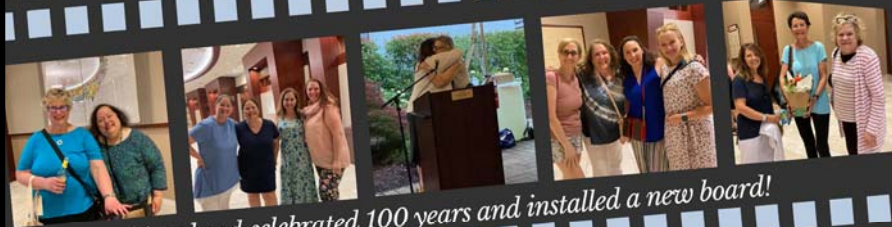
Sisterhood celebrated 100 years and installed a new board!