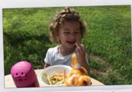
Teddy Bear Picnic