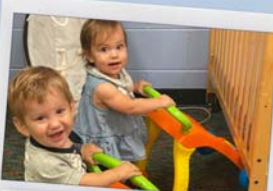
Fun in the infant room

BETH EL YOUTH DEPARTMENT USY (GRADES 8-12) / KADIMA (GRADES 4-7)