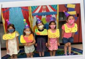
Clowns on parade