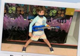
Rockin' and rollin'