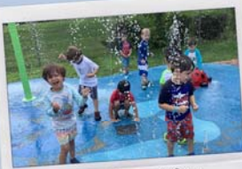
Splash pad fun