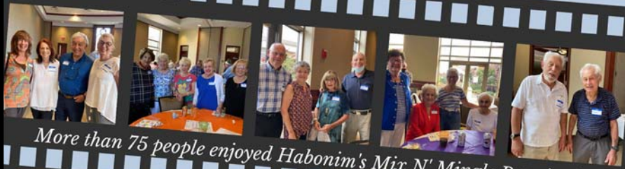
More than 75 people enjoyed Habonim's Mix N' Mingle Reunion!