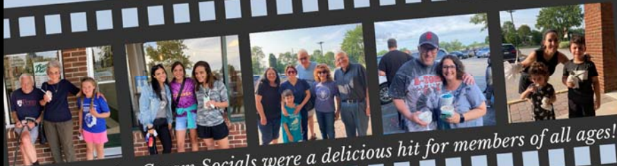
Our summer Ice Cream Socials were a delicious hit for members of all ages!