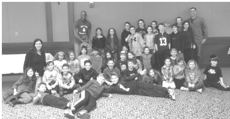
Members of the Shabbat Shalom Club