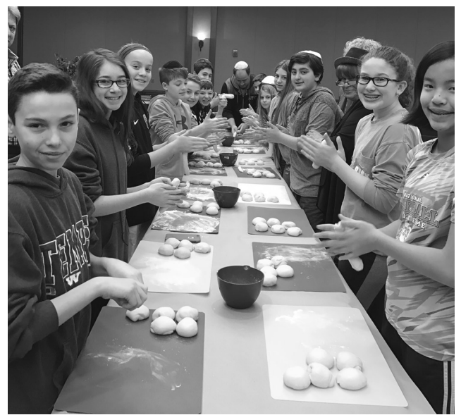
Tallis and T'fillin made challahs for the Chesed freezer