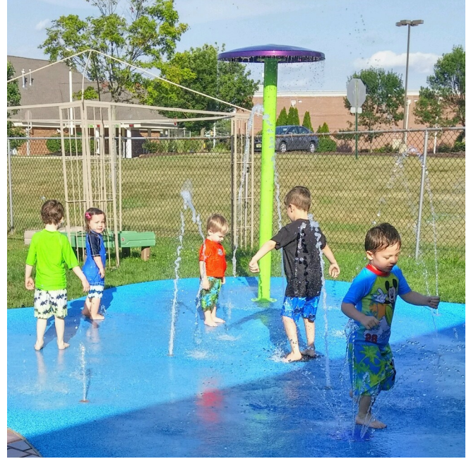
One of many super splash pad Tuesdays