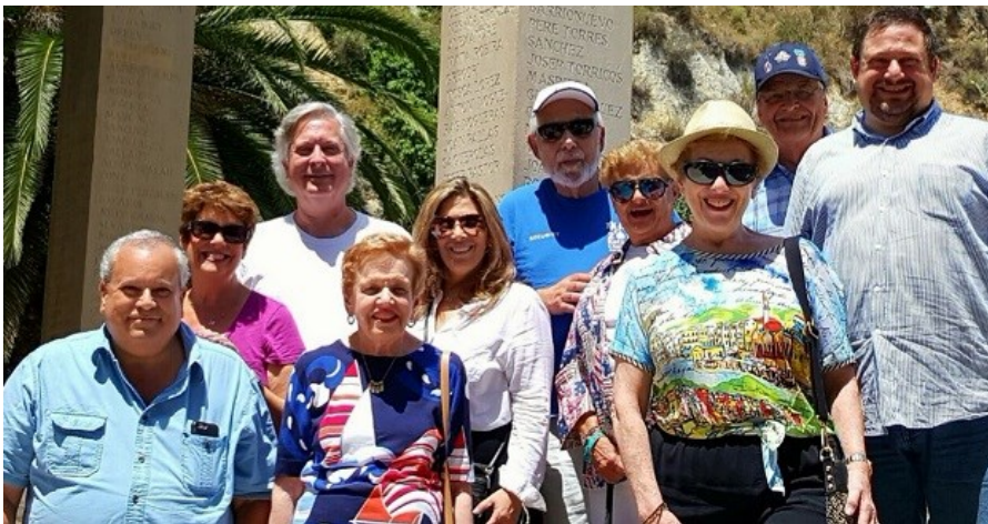
Our Beth El members in Spain with the Cantors' Assembly